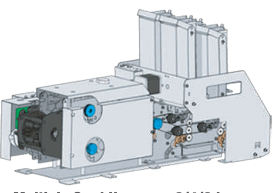
Multiple Card Hoppers- 2/4/8 hoppers