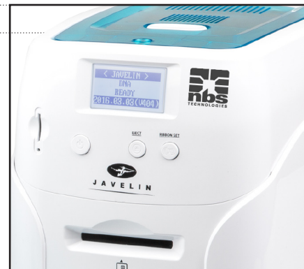
Easy to read 4 line LCD screen for clear notifications and prompts