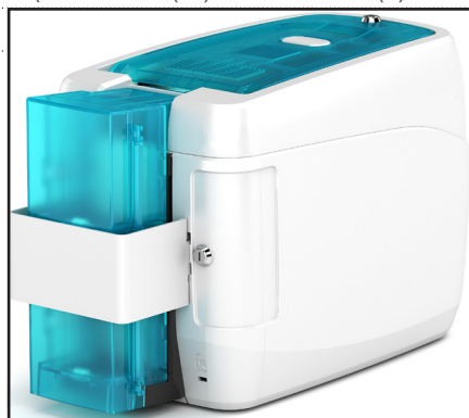
Additional security features and dual hopper option